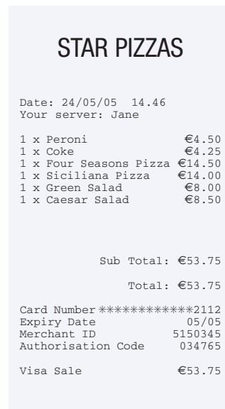
Typical example of receipt with Resident Fonts