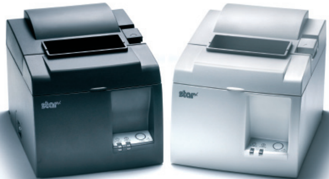
Full Speed USB interface with selectable serial port emulation