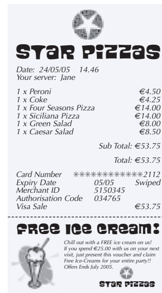
Typical example of receipt with TrueType fonts and Graphics